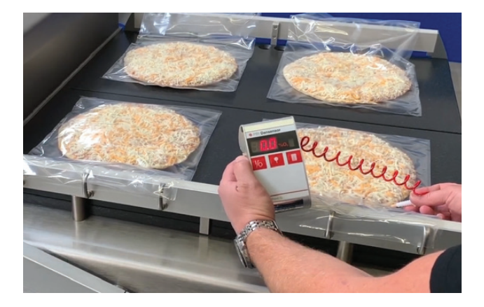
Double Chamber Vacuum Sealer for increased production.

Multiple packages per cycle with highest level of vacuum.