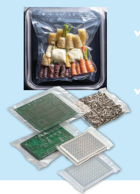
Ideal for restaurants, supermarkets, & food processors

Maximum air removal to protect electronics & parts during transport