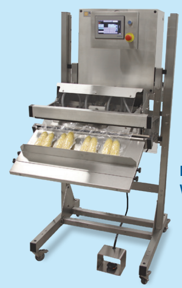
Fresh Pac Express Vacuum Sealer

Nozzle style vacuum sealers are the most versatile method of vacuum packaging. We manufacture industrial vacuum sealers for food, coffee, electronics, medical, industrial, and even for hazardous classified areas. Machines are designed with multiple nozzles to seal multiple packages per cycle. PAC's industrial vacuum sealers can be equipped with gas flush for modified atmosphere packaging (MAP).