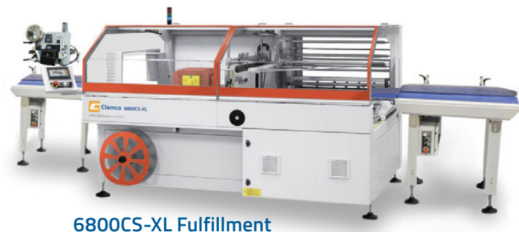
6800CS-XL Fulfillment Wrapper System

Rollbag R3200 Automatic Bagger with Kit Conveyor & Outfeed Conveyor