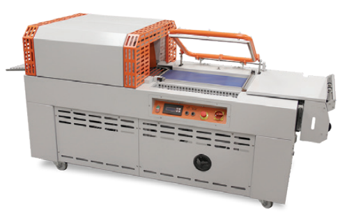
Clamco 250C Combo Shrink Wrapper