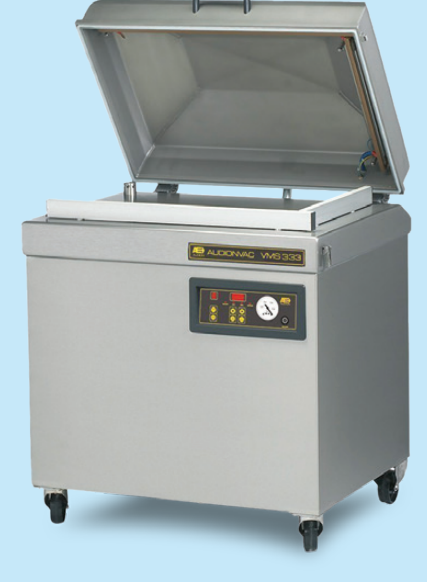
VMS floor standing Vacuum Chambers

Maximum air removal to protect electronics & parts during transport