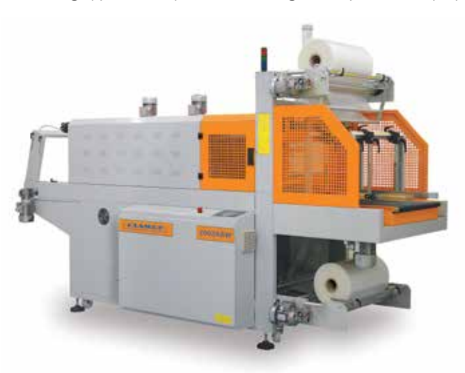
7002ASW Sleeve Wrapper

Designed for superior performance, the Clamco Sleeve Wrapper line ranges from semi-automatic to fully automatic and includes an integrated shrink tunnel. Clamco Sleeve Wrappers can be used for wrapping trays, cartons or bottles and are well-suited for bundling applications, perfect for storage, transport and display.