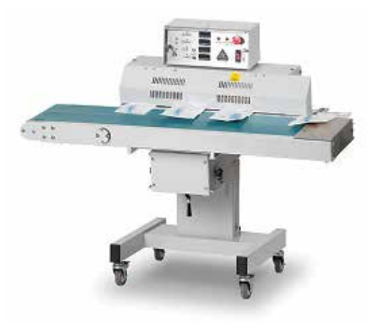
552 Med Validatable Medical Band Sealer

Nearly all sealing equipment from PAC Machinery can be configured for medical sealing validation. Choose medical versions of Rollbag Baggers, Bag Sealers, Band Sealers, Impulse Sealers, Vacuum Sealers, and Vacuum Chambers. Medical packaging equipment includes seal validation, monitoring of temperature, time and seal pressure with alarm systems. Sealers can be used with most medically approved packaging materials.