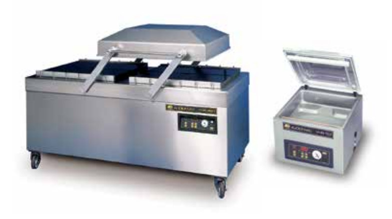
VMS Dual Chamber Vacuum Sealer

Packaging Aids also manufactures a full line of industrial chamber vacuum sealers, ranging in size from tabletop models to larger high production vacuum packing machines. Our experienced packaging engineers can custom design and manufacture vacuum sealers to meet unique packaging requirements.