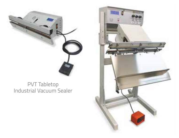
PVG Industrial Vacuum Sealer

Packaging Aids manufactures one of the most extensive lines of industrial vacuum packaging machines in the industry. Packaging Aids specializes in industrial nozzle vacuum sealers that are designed to meet the needs of the most demanding industries.