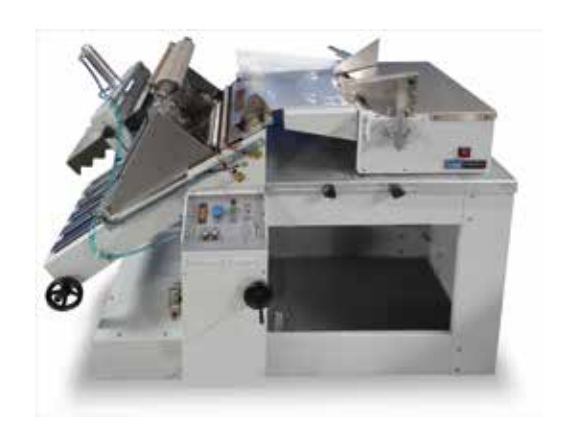
Titan Drop Sealer Fill & Seal System

Clamco manufacures an extensive line of bag sealers designed for a wide variety of applications. The easy-to-use bag sealers can increase both speed and productivity. Sealers are available in portable units, tabletop units or a complete bag sealing system to open and fill bags with options for bag compression prior to sealing.