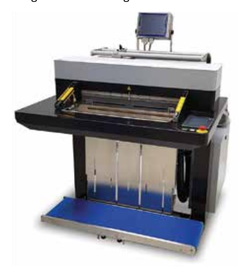
Rollbag R3200XL Automatic Poly Bagger

Rollbag systems are built for ease-of-use, reliablity and speed; and they can be integrated with printing devices and automatic feeding systems. Rollbag automatic baggers are engineered to use poly tubing in addition to bags on a roll.