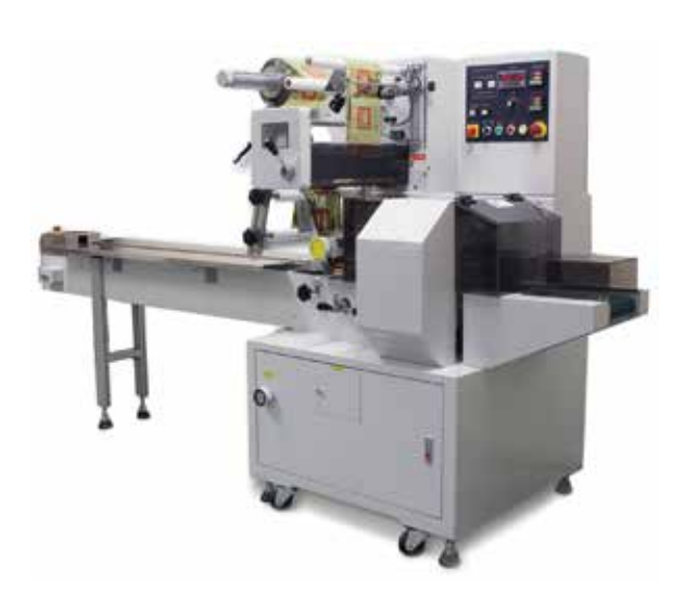
FW 400F Horizontal Flow Wrapper

Packaging Aids Flow Wrappers are ideal for suppliers of products that must be packaged indvidually with high quality film. Several sized units are available offering packaging speeds up to 60–250 packages/minute. The preferred choice for everyone from small startups to large companies with higher speed wrapping requirements.