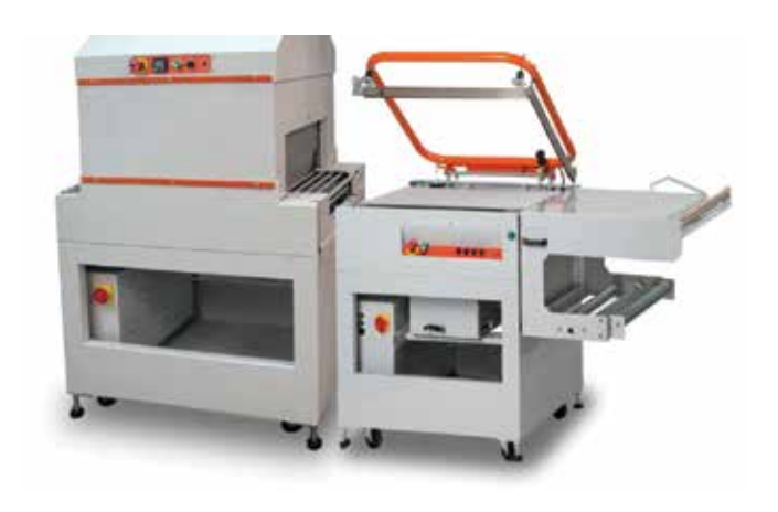
Clamco 4T Tunnel

Clamco manufactures a variety of L-Bar Sealers, Tunnels, Combos and One Step shrink units. Pair an L-Bar Sealer with a Clamco shrink tunnel for a complete shrink solution, or choose a Combo system which include a sturdy L-bar sealer and powerful shrink tunnel. Dempack One Step units incorporate seal, trim and shrink into a single operation.