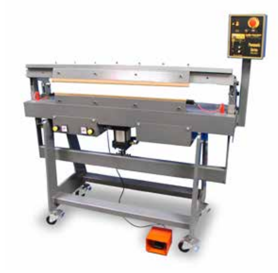
Vertrod PS Impulse Sealer

Vertrod manufactures exceptional quality, heavy-duty thermal impulse heat sealers. Vertrod offers bar sealers, bag sealers, and drop sealers, as well as compression sealers for applications that require the removal of air prior to sealing, Highly customized Vertrod sealers produce uniform, hermetic seals in a range of thermoplastic films, laminates, synthetics, and foams.