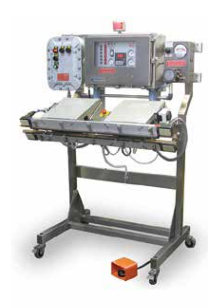
PVG XP Explosion Proof Vacuum Sealer

Packaging Aids, Vertrod and Clamco packaging equipment can be customized for specific applications, including medical validation. Designs include special options and features, such as our Explosion-Proof sealer for hazardous areas. Please contact our packaging specialists for the latest custom packaging solutions.