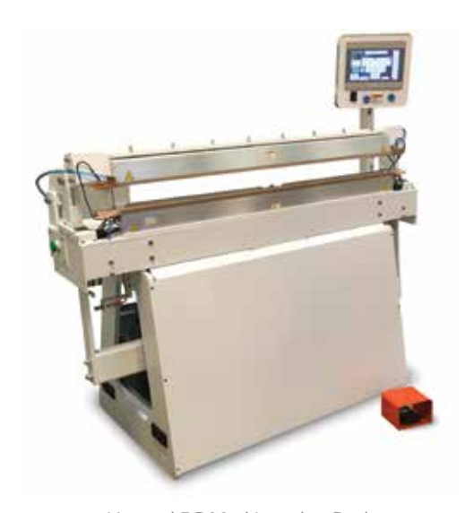
Vertrod PS Med Impulse Sealer

Vertrod's validatable medical sealers are built to the same durable standards as all Vertrod thermal impulse sealers. These sealers feature real-time monitoring of all sealing parameters and an alarm feature to prevent operator error. Output ports allow for calibration and verification of all controls.