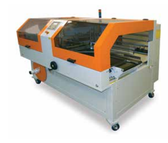
6800CS Side Sealer

Clamco automatic, high-speed, shrink packaging machines are built for top performance. Clamco side seal and L-bar sealers are as dependable as they are easy to operate.