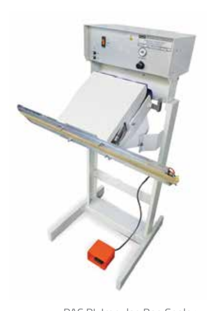
PAC PI Impulse Bag Sealer

Customers depend on time-tested, bag and pouch sealing machines from Packaging Aids. Our engineers can configure highly customized solutions to satisfy the most unusual or complex customer requirements.