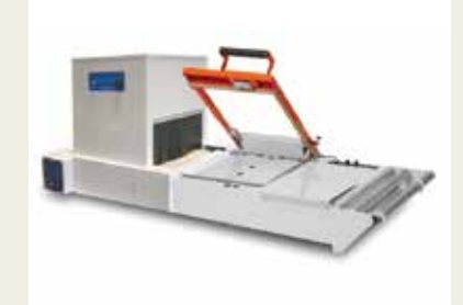
Clamco Combo Junior shrink wrap system