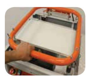
Ergonomic by design, the tubular seal arm delivers dependable, long-term service.